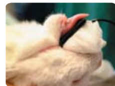
EVA-Vet Digital Sensor in position on a feline mandible. Animal Dental Training Center, Towson, MD.